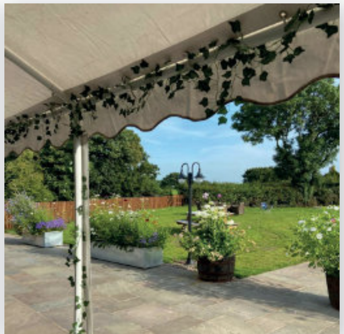
Full use of the marquee, with customisation available