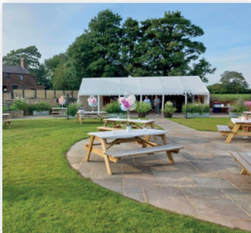
Beer Garden with Wheelchair Access