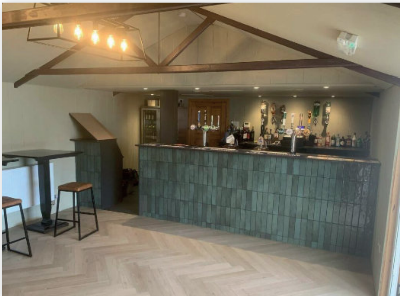
Fully Stocked Private Bar